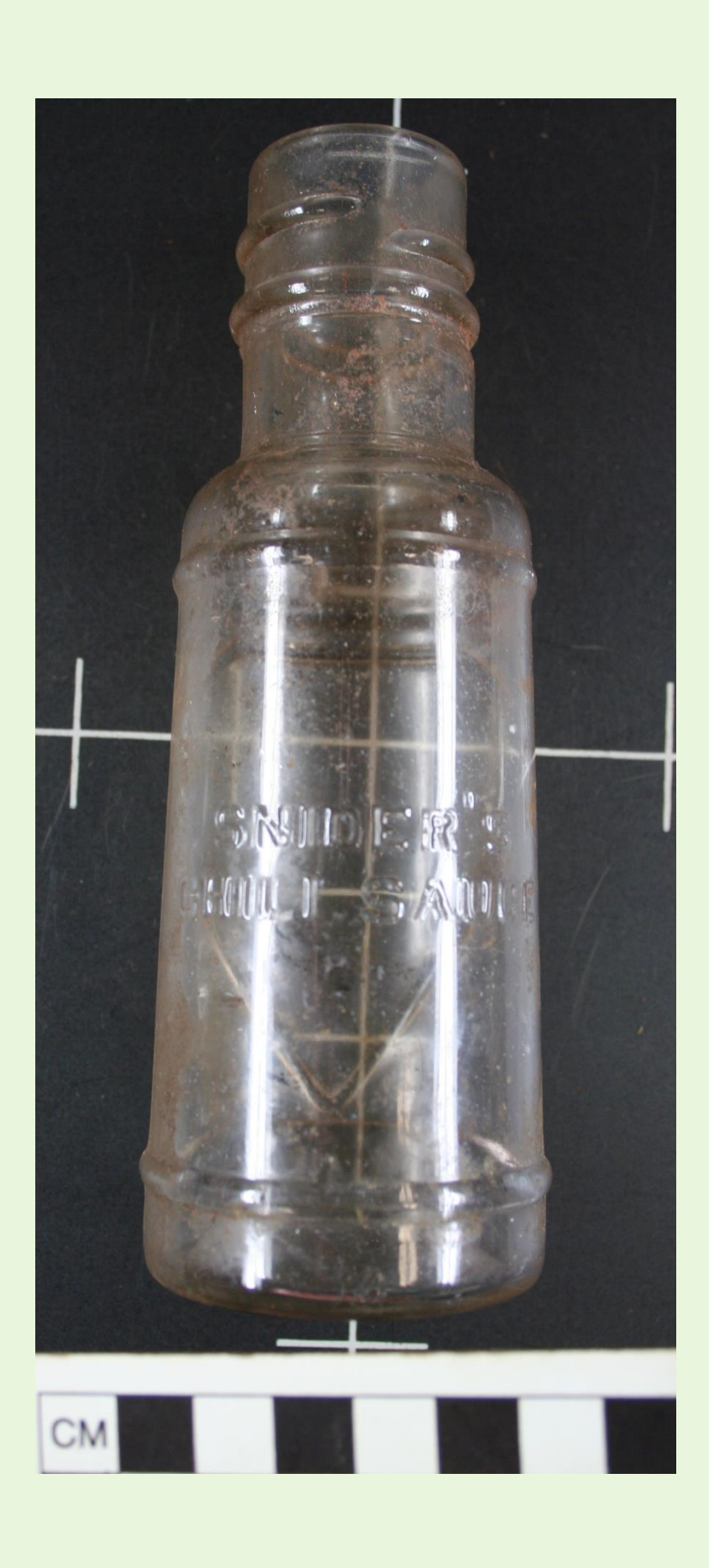
SNIDER'S CHILI SAUCE EAG-339, 2006, #9893