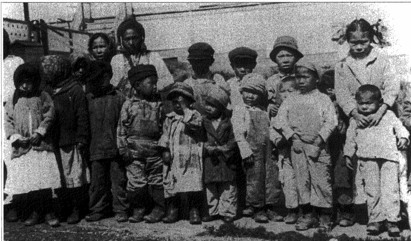
Figure 4: Native children of Naknek who were orphaned by the 1919 influenza epidemic, no names provided (Branson 1998, photograph # H-427).