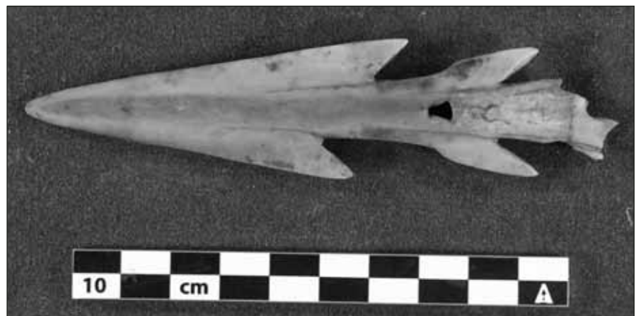
Figure 3. Late Birnirk–Early Thule-style harpoon head.