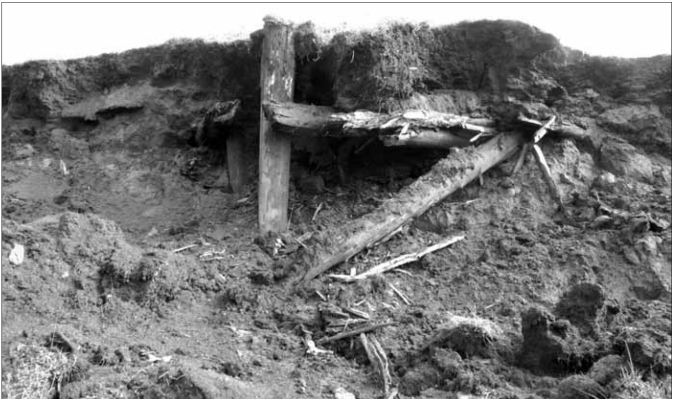
Figure 1. Eroding house viewed from the beach.

We recovered two of Stanford's three site datums and were able to record locations within his site grid. All artifacts were point provenienced with the transit. Other