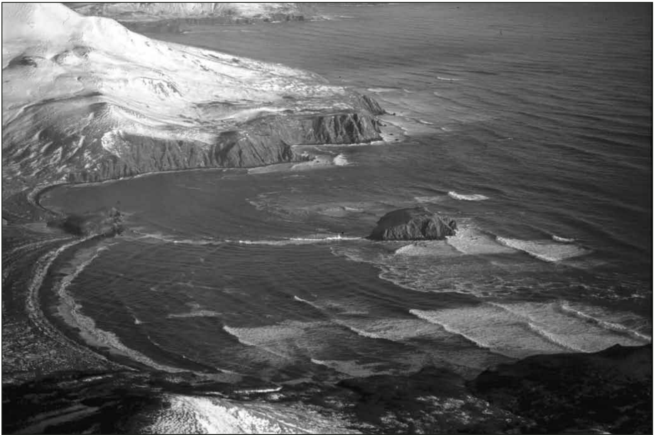
Figure 1. Aerial view of Awa'uq (Refuge Rock) looking north, December 2000.

et al. 2002). Further analysis of the faunal remains was not conducted prior to the current study. If any natural or arbitrary stratigraphic breaks were used in the field excavations, no record of that was documented. Thus, the entire assemblage is treated here as one cohesive unit, spanning an unknown period of accumulation prior to the abandonment of the village in 1784. Note that if some or all of this particular midden deposit is associated with the Koniag-age house pits, the materials could date to as early as AD 1200.