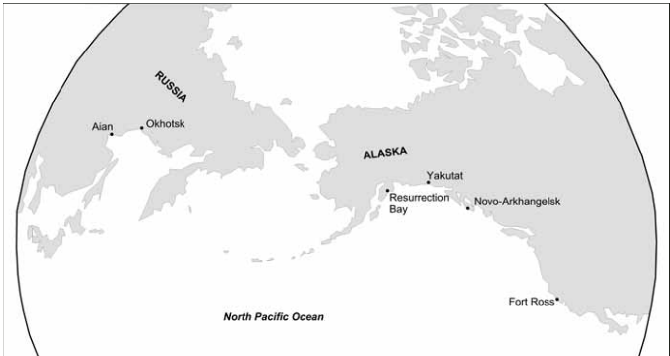
Figure 1. Shipyards of the Russian-American Company. Map by Jason Rogers.

Nevertheless, by 1794 the first Russian shipyard in Alaska and the first shipbuilding facility on the entire Pacific coast of North America began its operation at Voskresenskoe settlement in Resurrection Bay (Seward) (Fig. 1). Here English shipwright James George Shields constructed three ships: the Phoenix , Dolfin , and Sv. Olga . To make up for the shortage of pitch, paint, and oakum, the ships were caulked with a mix of pitch, ochre, and whale blubber. These and other creative shortcuts affected the vessels’ performance. In 1795, only a few months after the Olga was finished, Baranov took her on a voyage to Yakutat Bay. On the second day at sea she sprang a leak and