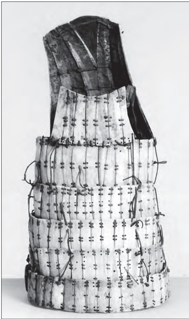
Fig. 2: Transition of plate armor to band armor (photo from Rousselot and Grammer 2004: 156).

like construction consisting of five bands or rows of ivory plates fixed together with leather straps. The top row stays fixed, while the four others can be lifted up to the hips in the manner of a telescope (see the full reconstructed picture of an armor-clad warrior in Fitzhugh and Crowell 1988:227). A complete set of band armor was collected by Commodore John Rogers from the Chukchi Peninsula in the later 19 th century and is archived in the Smithsonian Institution (Hough 1895:Pl. 4). While band armor is mentioned in the annals of the 12 th century Khitin dynasty of northern China (Laufer 1914:191ff), it may be considerably older. The Yupik Eskimo from Plover Bay, Siberia, right across from St. Lawrence Island, also used another type of band armor, constructed of baleen strips (Hough 1895:634; in Hough's report the armor is called "Chukchi").