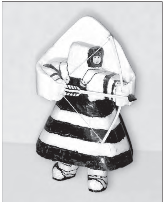
Fig. 3: Yupiget ivory sculpture of a warrior with band armor, by Larry Aningayou (H.G. Bandi, personal collection).

I had my first direct contact with an armored warrior in the shape of a sculpture at Gambell early in the 1970s.