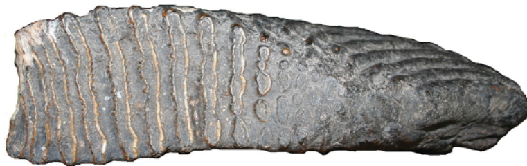
Occusal surface of mammoth tooth